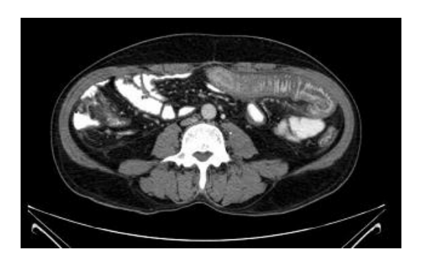
Figure 2. Small bowell involment.

Palpable purpura skin lesions in the upper and lower extremities (Fig 1). According to the skin lesions of the patient, the candidate for examination is vasculitis (Table 1) and remarkably, the previous NCV-EMG bias indicated the normal result. In imaging study (CT and Barium), intra luminal involvement was detected in the small intestine in the areas of ileum and jejunum (Fig 2). The patient was referred to the adult gastroenterology and liver center, Razi Hospital for examination of the digestive system. Endoscopy of the erosion of the stomach anterior, bulb, duodenum and sub epithelial peteche, and colonoscopy erythema and loss of vascularity was revealed in the ascending, transverse and descending colon (Fig 3). In the sampling of new skin lesions, the IgA sediment was determined in DIF and with the diagnosis of HSP, corticosteroid therapy started for the patient.