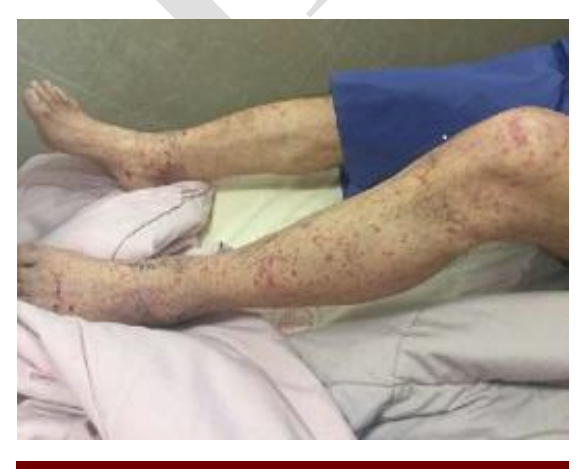
Figure 1. Palpable purpura skin lesions on the lower limbs.

A 57-year-old man with a severe abdominal pain (pain score8 / 10) periumbilical pain was referred to the Razi Hospital in Rasht. The pain of the patient is aggravated by eating, decreases with bowel movement and does not spread to the other organ. One set of feces (loose, bitterness, stinky) and a significant of 10kg weight loss over the past month indicates the Family history of duodenal cancer in his father. He was hospitalized at the center of neurology one year ago due to paresthesia in the upper left limb, which was discharged with the diagnosis of small vessels disease. In the history of the drug, Atorvastatine, ASA 80 mg/daily, Allupurinol 100mg/daily Ibuprofen and 400mg/PRN for reducing pain in the last month were prescribed. The patient was examined as an outpatient abdominal pain that, on day 17 (2 days after CT, with contrast), begins with symptoms of