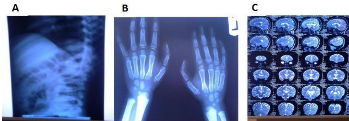
Figure 1. Imaging of MPSIIIC patient's body. A: beaking of vertebrae, and widening of the ribs; B: widened tubular bones, and expanded metacarpal bones; C: MRI results of patients brain where no major anomaly was observed.