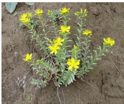
Figure 1. A view from H. orientale plant at flowering.

(11) and anti-angiogenic (12) effects were also reported for hyperforins. Hypericins are well known pharmaceuticals with their documented anti-viral, anti-retroviral, photodynamic, anti-bacterial, anti-depressant and anti-tumoral activities (13). Although hyperforin and hypericins have been reported to mainly contribute to the pharmacological effects of Hypericum extracts, flavonoids and phenolic acids have also made an important contribution to the anti-depressant (14) and anti-microbial (15) activities, respectively.