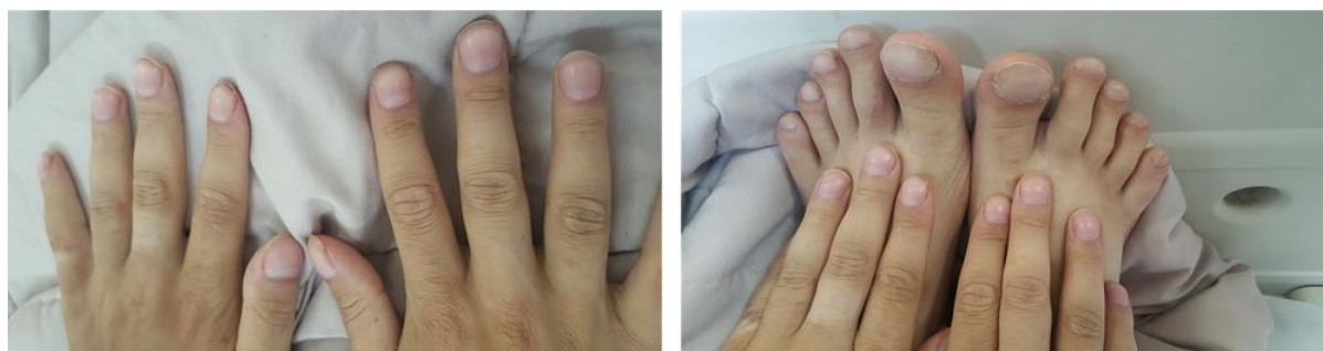
Figure 2. Clubbing is a deformity of the finger or toe nails.

liver (liver span: 196mm) and spleen (spleen span: 166*72mm), and no evidence of thrombosis in the liver and portal veins was evident. Correspondingly, free fluid was seen at moderate to severe level in the abdomen and pelvic, subsequently the ascites were detected and therapeutic tap was performed that the high SAAG (1.7mg/dl) and low protein were reported. Dynamic liver CT showed that the peripheral part of the liver had mild hypoattenuation, which is compatible with reverse portal venous blood flow. The hepatic veins could not be well seen. Also, enlargement of the caudate lobe is noted. Portal vein is normal in course and caliber without clot formation or thrombosis (Figure 3). The findings of CT scan reveal enlarged liver and spleen with evidence of Budd-Chiari syndrome. The cardiac output was 55% and the pulmonary artery pressure was 35-40 mmHg, a little fluid was seen in the pericardium. Considering the possibility of BCS,