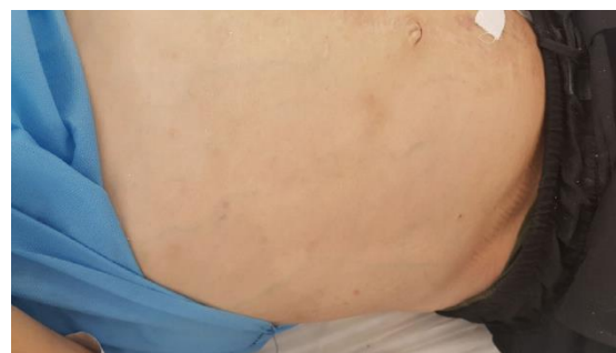
Figure 1. Ascites, caput medusa and umbilical hernia.

The conjunctiva was not pale and sclera was not icteric, the kayser fleischer was not seen and Jugular vein pressure and lung auscultation was normal, also, the sound of the heart was normal, without murmur and extra sound. During the inspection of the abdomen, it was symmetric with distention and umbilical hernia and the cuffs were prominent (Figure1).The intestinal sounds were normal, mild tenderness was in periumbelical and the rebound tenderness has been negative. The patient had clubbing in his hands and feet (Figure2). Other clinical manifestations are listed in the table1.