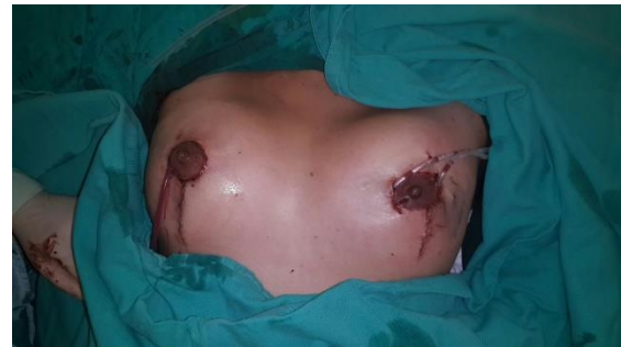
Figure 3. Surgical excision and reconstruction with implants of both breast.

follow-up and fat injections are planned for the minimal retractions on breast skin.