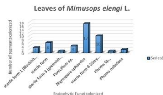
Figure 3. Colonization frequency of endophytic fungi recorded form leaves of Mimusops elengi L.