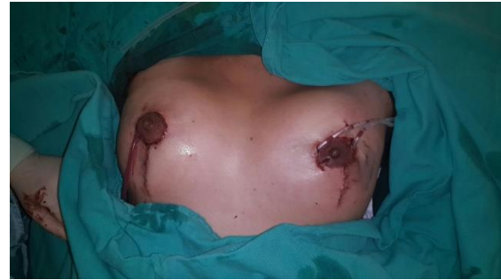
Figure 3. Surgical excision and reconstruction with implants of both breast.

follow-up and fat injections are planned for the minimal retractions on breast skin.